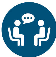
Employee Assistance Programme