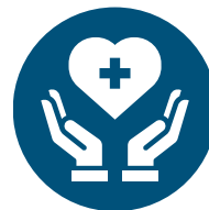
Group Life Cover