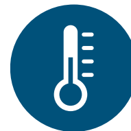
Health Cash back plan