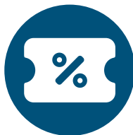
Long Service Vouchers