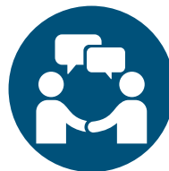
Staff Meetings to Share Good News