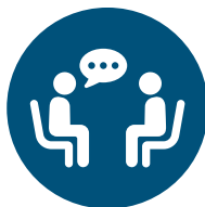
Employee Assistance Programme