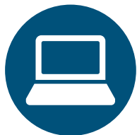
Flexible Working Policy