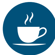
Cafe with 20% Discount