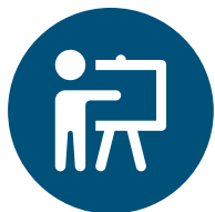
Full Training Package