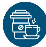
Staff Room Refreshments